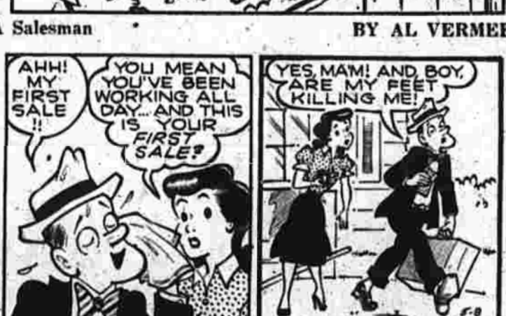
Life of a Salesman