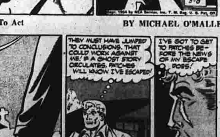
Time to Act